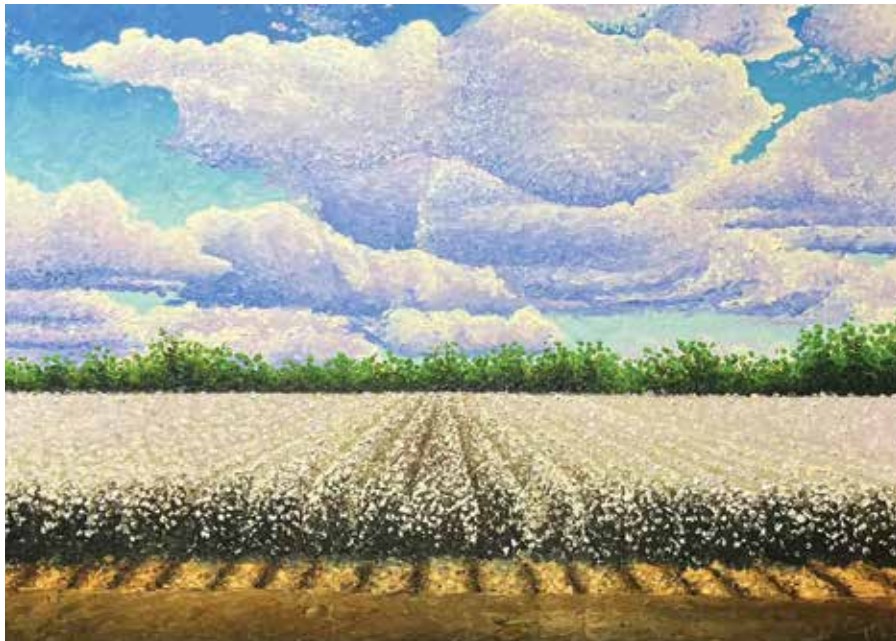
Her Delta landscapes capture the sights every Delta resident loves most!