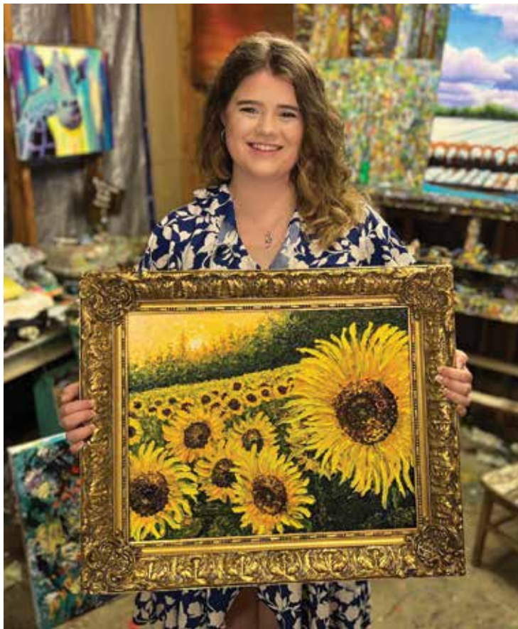
Sunflowers are a favorite subject.